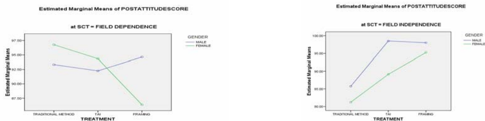
Figures 3a and 3b. Interaction of effect of treatment, gender and style of categorisation on students' attitudes toward mathematics