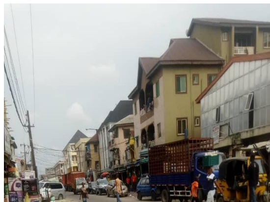
Typical Street Layout in Ebute Metta