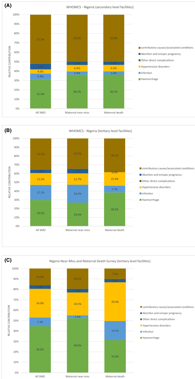
Figure 2. (A–C) Relative contribution of key groups of complications by outcome severity.