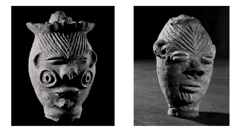
Fig. 5: Terra Cotta heads from Egbejoda area near Ifèshowing "V" shaped striation patterns.

The design however lasted enough to be integrated into the culture of the people and reflected in their art. This study concludes that the striations are however not indigenous to Ifè - Its origin is further north. The pattern was contracted into several simpler versions now worn by the Yorùbá particularly of the Oyo line. (Adepegba, 1986) Furthermore, unlike the Ifè striation, the Tera tribe design features a main mid-rib running down from his forehead, through the ridge of his nose, which then passes the lips down to the chin. The other striation lines take root from this middle artery but run almost parallel to it in the same fashion as the Ifè style. The variations noted in Zarma's design might be traced to factors of tribal disputes and factional break-ups and ultimately a modification of the traditional tribal mark. It must be noted that even among the Ifè head pieces discovered and catalogued by researchers, there are a number of pieces that vary from the fundamental Ifè style. The variation feature a slight slant creating an inverted "V" as seen on Mallam Zarma's head in Fig 2 (middle photo). This "V" pattern can be seen on some Ifè pieces too. See Fig 5. Some headpieces as catalogued by Willett in his work feature this observed "V" pattern on the forehead. (Art of Ife. CD ROM, 2001)