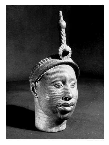
Fig 4: The Olokunhead

Curious enough, when one studies the tiara on the "Olokun" head piece, the protruding tip that points upwards and the round band that sits on the head do in fact look like objects crafted from the weaving of ropes and beads. (See fig 4) In the ancient times they may have used ropes made from some kind of organic thread as part of the materials used for the tiara that was represented on many of the Ifè heads. This makes it significantly different from the fully covered beaded royal cap we find of the half and full brass figures of the Ooni and miniature royal couple figure showing an Ooni and his wife. This difference in style may suggest that the scarified heads with the 'rope and bead' tiara are generally not images of Oonis (Ifè kings) rather portraits of other immigrant or ward chiefs.