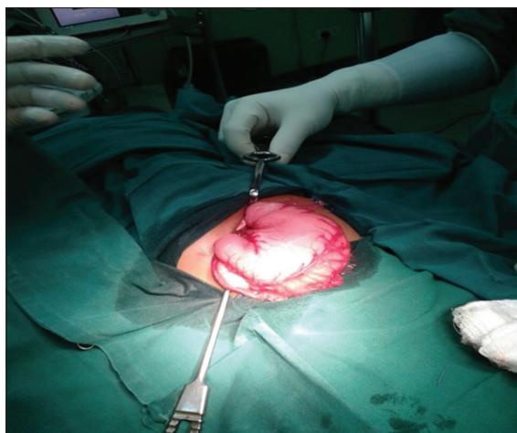
Figure 2: Intraoperative finding of gut malrotation showing dilated gastrium (original)